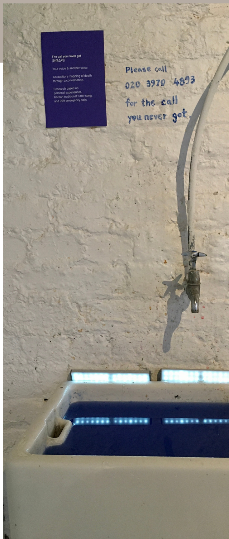
For The Time Being

In 2022 we launched Gravel , an ongoing series of live work events taking place every 2 or 3 months in hARTslane. Designed and curated by performance artists and alternating guest curators, the idea behind Gravel is to present live work as something