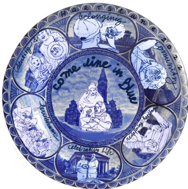
'Redefining heritage' – Illustration by Tisna Westerhof