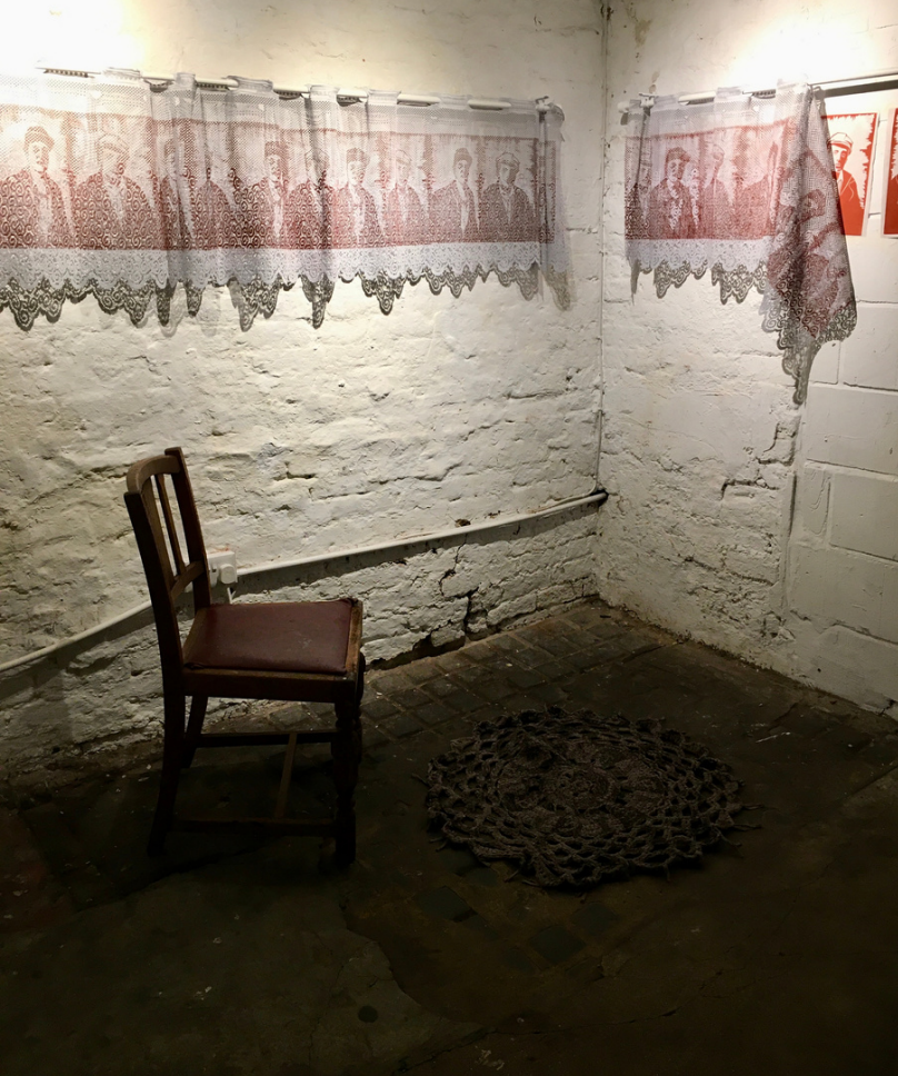
Enough is Enough