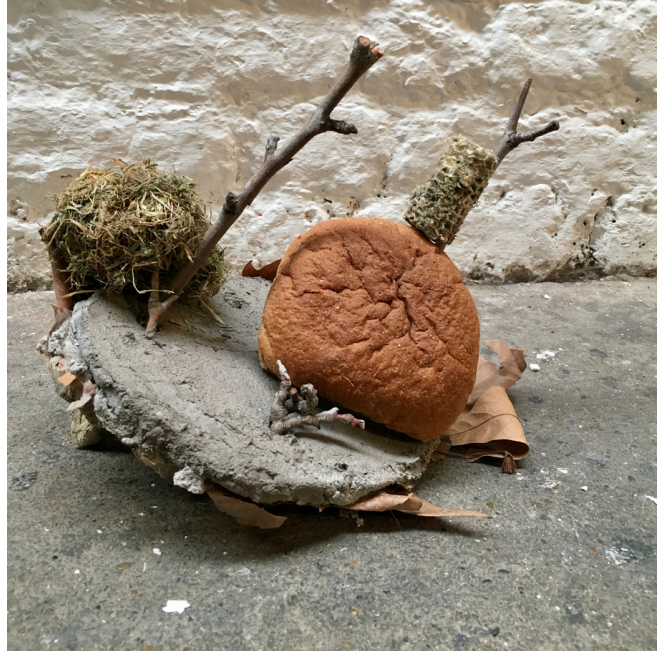
For The Time Being

Our cultural programme aims to make the art world more transparent and accessible both for artists and the community. We have a policy to 'say yes to artists', regardless of CV or art backgrounds.